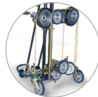
Quick conversion from drill rig to wire saw