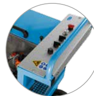
Clear, user-friendly control panel