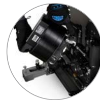
Tool-free motor fastening