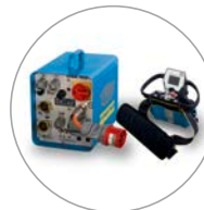
Compact and light control unit, handy remote control with display

The WSE1621 was developed for universal usage and the daily use on the construction site. Thanks to the digital features and the compact and light design, this newly developed system is setting new standards in wall sawing. Assembly and disassembly are done