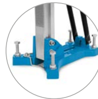
Compact dowel foot