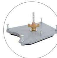
Optional vacuum plate

The DRA150** is extremely well-suited for electrical and installation work. This drill rig is suitable for 550 mm drill bits and