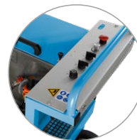
Clear, user-friendly control panel