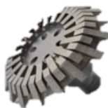
STEP 2, 3