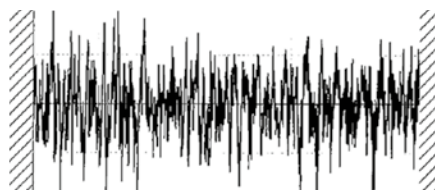
Surface finish grinding R_a = 0.223

Teeth: Module 2.8 / pressure angle 20° / number of teeth 40 / tooth width 34 mm