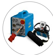
Compact and light control unit, handy remote control with display

The WSE1621 was developed for universal usage and the daily use on the construction site. Thanks to the digital features and the compact and light design, this newly developed system is setting new standards in wall sawing. Assembly and disassembly are done