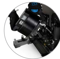
Tool-free motor fastening